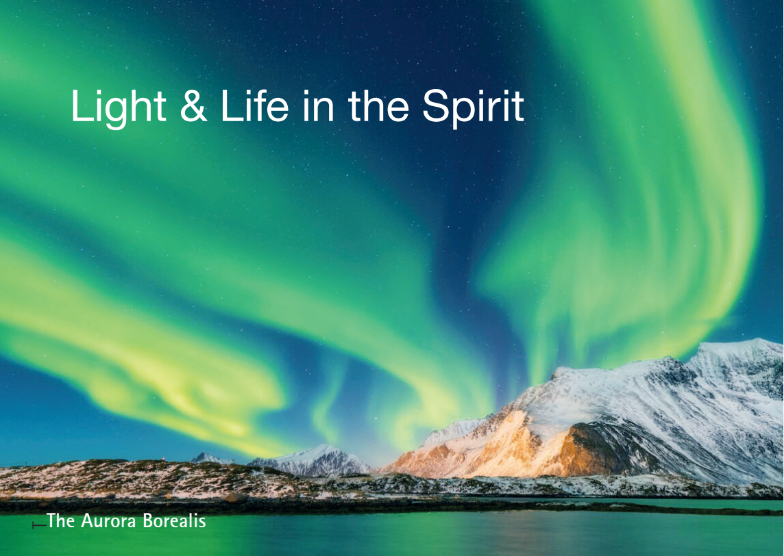
— The Aurora Borealis