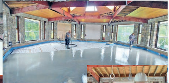
The new floor slab is poured over the underfloor heating.