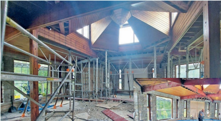
Supporting the roof as the pillars in the Marsh Lounge are removed.

Over the last few months, we've completed some major renovations at Scargill! Amongst other things, the Marsh Lounge has been refurbished and the pillars removed. There is a new car park and new windows in Old House. We've put together some pictures to give you an impression of the work that's been underway - and what to expect the next time you visit Scargill! We are very grateful for all the donations and support we've received to make this possible.