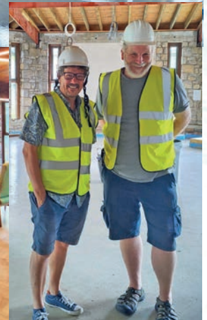
Bob the builder and mate!