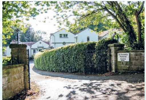
Entrance to St Oswald's