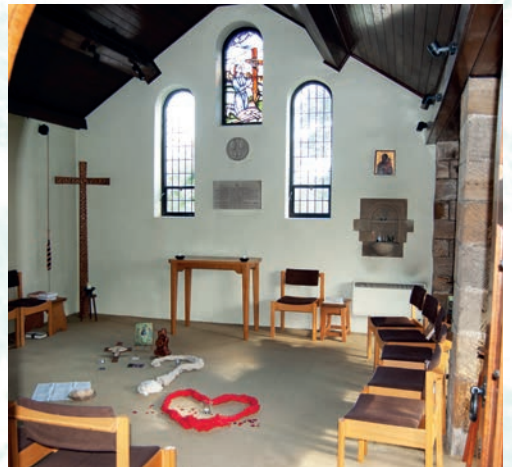
The beautiful chapel