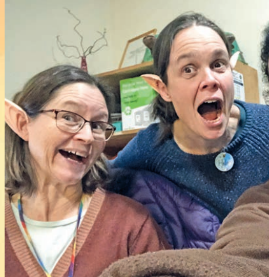
'Hello. Scargill Reception. How do you do?'