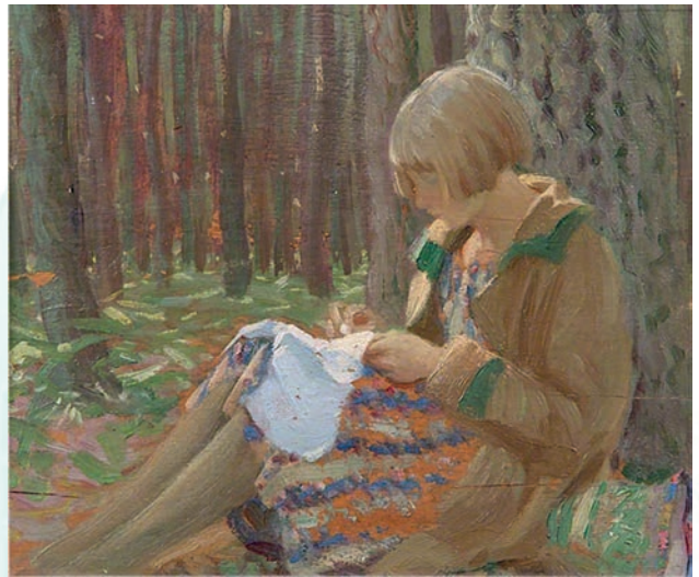
'Mary sitting in a wood', by Louis Ginette.

T he other day I went up to morning prayers and I found the table beautifully covered with daffodils and large pebbles/stones. Blue and brown fabric fell down, alongside the potted tree from the morning room, and across the floor in front of the table in folds playing with the small gems, candles and more pebbles. We were