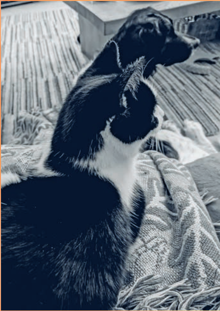
'People at Scargill can be really silly, can't they?' 'Yes. Best not to laugh, it only encourages them.'