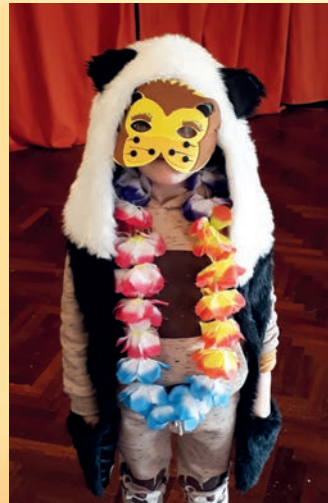
'I'm sure it said fancy dress.'