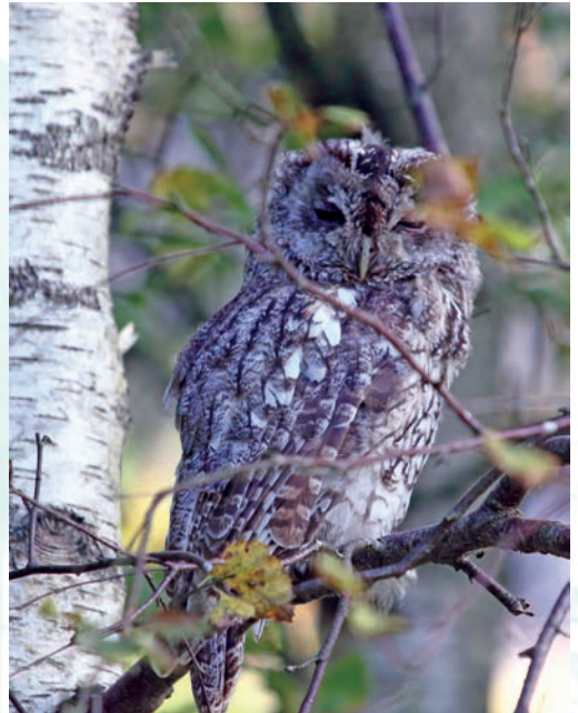
Tawny owl (right) and (below) the sensory pond above the chapel

On the estate, we are continuing to care for the range of habitats here to encourage wildlife to flourish. We were delighted to discover some newts had taken up residence in the sensory garden pond last year. Tawny and barn owls are often seen around the woodland, and occasionally long-eared owls too. Strimming and raking our meadows in autumn encourages wildflower growth. Within the house, we are looking at ways to continue to improve our sustainability in all areas, including recent experiments with a hot composter to recycle more of our food waste.