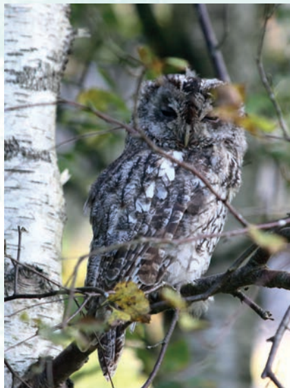
A Tawny Owl

'Hope is the thing with feathers, that perches in the soul.'